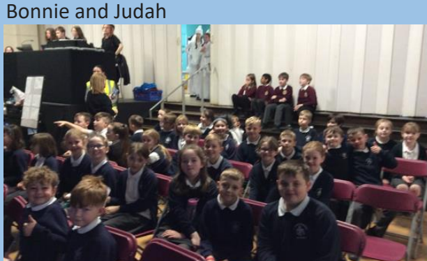
Figure 1 Y4 watch Frozen at All Hallows